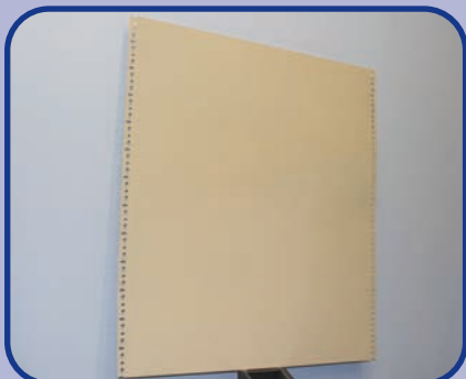
BACK AND SIDE CLADDING SHEET