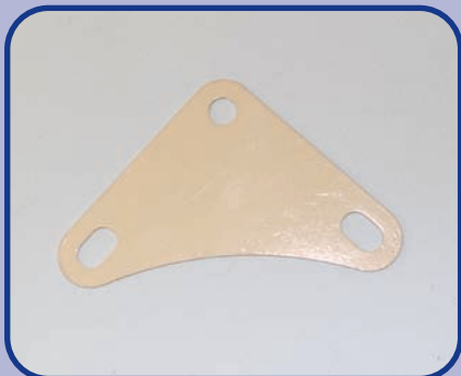
CORNER PLATE PLASTIC FOOT