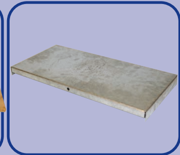
TIMBER DECKING STEEL DECKING