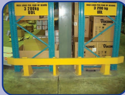
ROW END BARRIER UPRIGHT GUARD